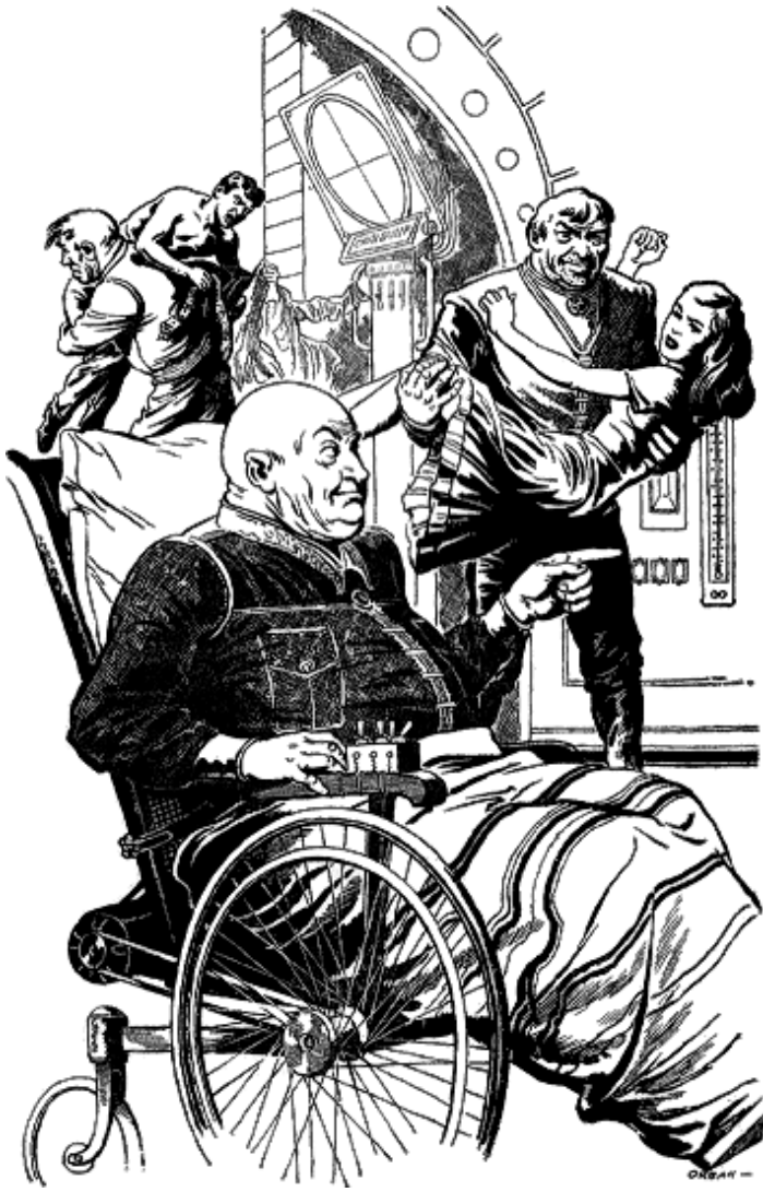
Figure 1: Illustration by Paul Orban

THE WHEELCHAIR tracks abruptly made a ninety-degree turn and ended at a blank wall. Somewhere beyond it must be the communications room.